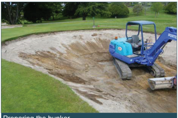
Preparing the bunker