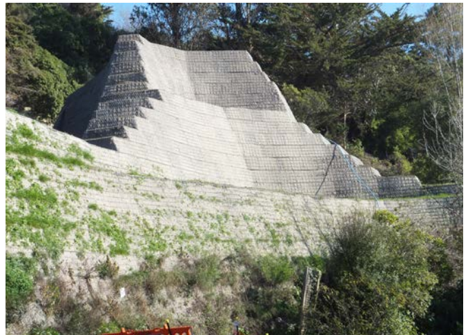
COMPLETED Green Terramesh Bund at Apex

The GTM bund construction took the contractor - Fulton Hogan approximately 1 year to complete. It was completed in early August 2016.