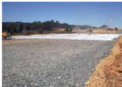
Placing Mirafi® PET geotextile reinforcement over drainage layer