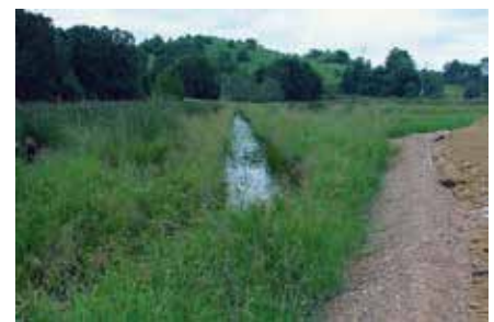
Ground conditions at site

Mirafi® PET woven polyester geotextiles were placed across the top of the drainage layer to provide the basal reinforcement stability for the embankments. Depending on the height of the embankment sections,