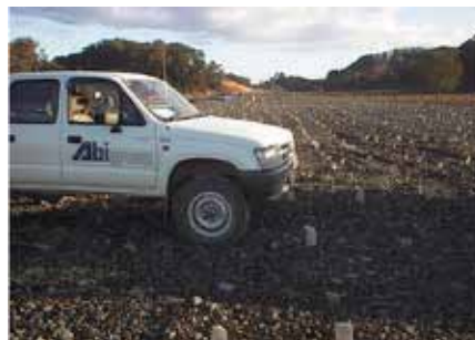
Placement of PVD's through gravel drainage layer

After 9 to 12 months the excess surcharge was stripped off the top of the embankments and the surface was graded and prepared for the placement of the freeway pavement. Once the concrete pavement had been constructed and the ancillary structures