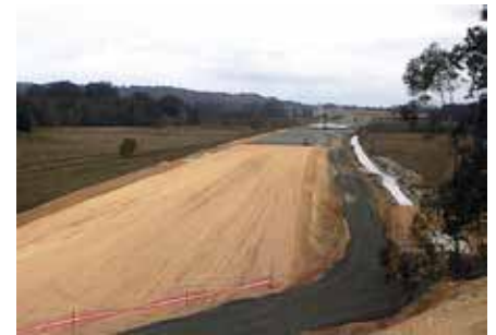
Embankment under construction