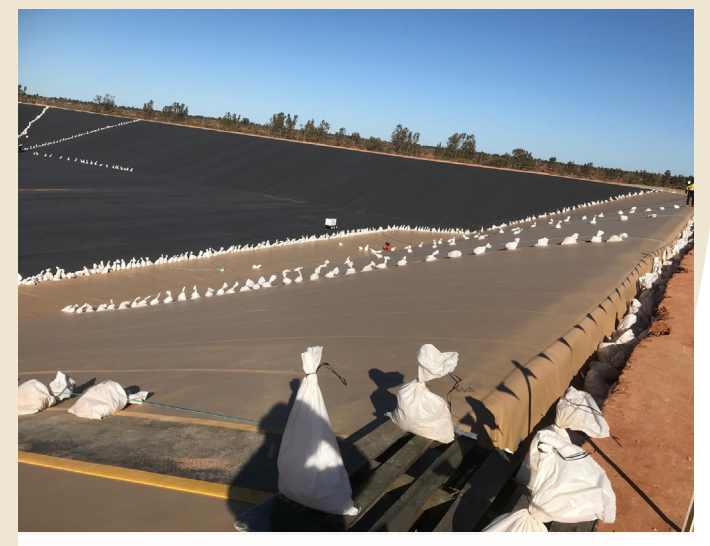
CSPE primary liner (brown) being installed over the conductive geotextile

Geofabrics also supplied the geocomposite drain (or geonet) material to provide the drainage layer between the primary and secondary lining layers.