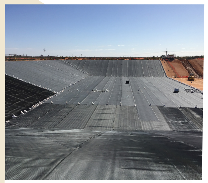
Geocomposite drain and conductive geotextile being installed