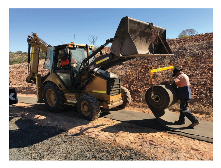
Dispensing Concrete Canvas