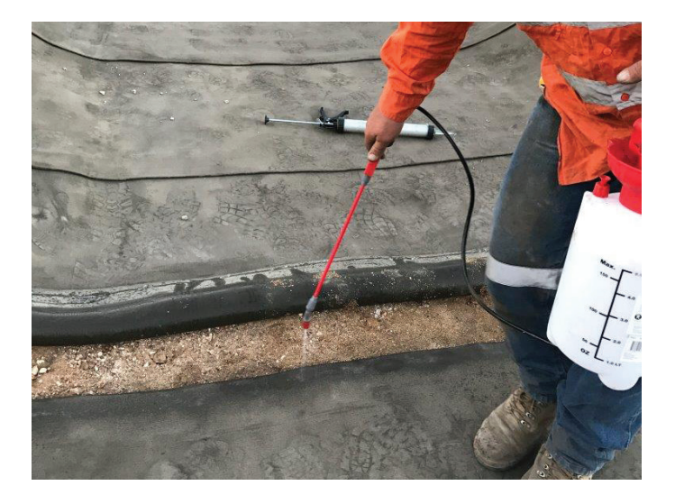
Hydrating the Seam

Completion of the project including earthworks, installation of and hydration of the Concrete Canvas took 4 days utilising CC8 and a crew of four men utilising a 5 tonne excavator. The installation was extremely successful and based on the contractors calculations there were considerable cost savings to using Concrete Canvas compared to conventional concrete methods. The contractor also found the product extremely easy and quick to install, leaving the contractor keen to use the product on other projects.