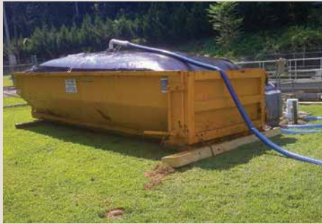
Geotube® Mobile Dewatering System

TenCate Geotube® dewatering and containment technology is a simple, low tech solution ideal for remote or highly industrialized locations. TenCate Geotube® containers can be customized in size and shape to meet almost any need. Whether an individual Geotube® unit is required to fit into an underground gallery, or multiple, large tubes need to be stacked above ground to accommodate large volumes within a specific footprint; whatever the situation, TenCate can customize a dewatering solution right for you