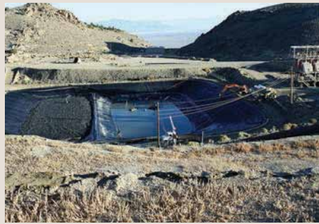
Barren and pregnant ponds

By capturing and containing valuable metals using TenCate Geotube® containers, the expense of treating mine waste can be offset and become a valuable income stream.