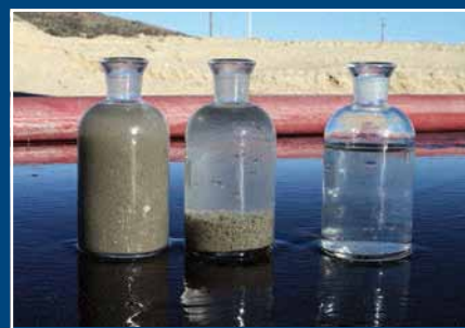
Sludge before (left) and after (right) treatment with Geotube® dewatering technology.

TenCate Geotube® containers can be custom-sized to fit available space and be easily removed when dewatering is complete. Dewatered solids can be safely stored on site, re-utilized to build dykes and berms, or disposed of in a landfill without expensive dredging or transportation.