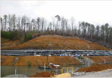
Dewatering of waste slurry

Whether it be a natural disaster, a catastrophic event affecting tailing ponds, permit restrictions, interruptions of mechanical dewatering processes, above or underground capacity limitations, or sudden increase in slurry production that strains the existing dewatering facility, TenCate Geotube® containers, in a variety of sizes to fit almost all situations, are readily available to restore tailings operations.