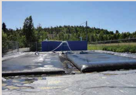
Closed loop process for drilling water management

The specially engineered TenCate Geotube® textile retains the solids while releasing the clear water through the pores of the fabric. The effluent is typically of a quality that can be reused for mine processing operations, making this an economical and sustainable technology for mine water management.