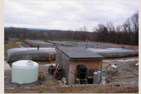
Geotube® dewatering cell