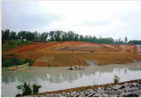
Reclaimed site after dewatering