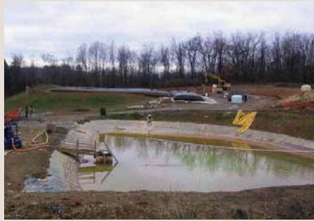
AMD sediment pond

The treatment process of an AMD waste with TenCate Geotube® dewatering technology is accomplished through the containment and dewatering of the precipitated solids. The dewatered solids can then be safely and economically disposed in an approved landfill site thus eliminating an environmental problem.