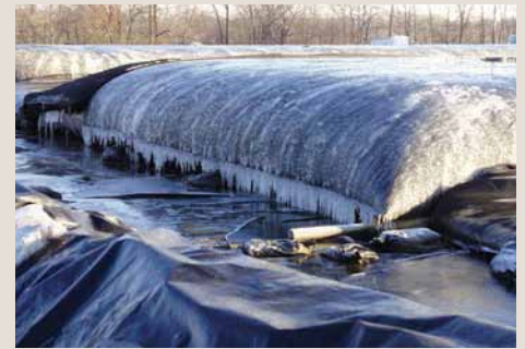
Dewatering under winter conditions